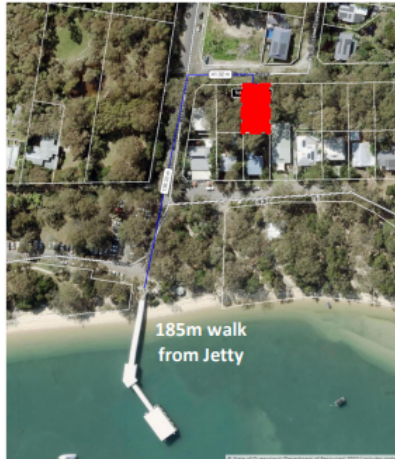
Proposed Ambulance Shed Location

QAS has developed a concept design for the proposed shed. It is approximately 11.50 metres x 7.65 metres. Subject to satisfactory due diligence, the project will be progressed through an Infrastructure Designation under the Planning Act 2016. The process includes impact assessment and stakeholder engagement.