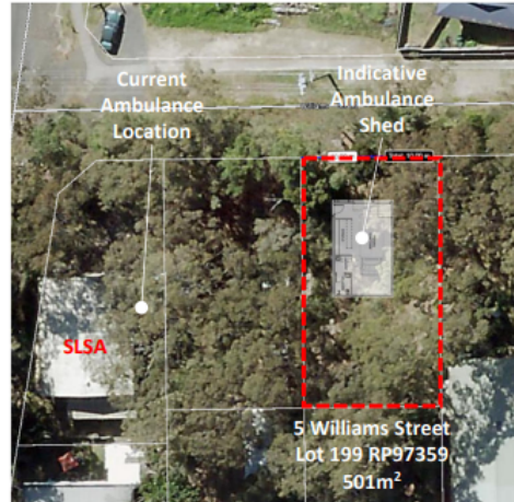
Proposed Ambulance Shed Site

If you want to provide feedback to QAS, please contact the Metro South Regional Office: msregion.execcorro@ambulance.qld.gov.au