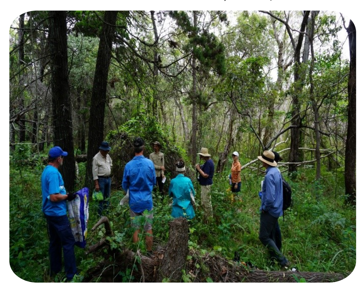
Weeding workshop with Bushtekniq