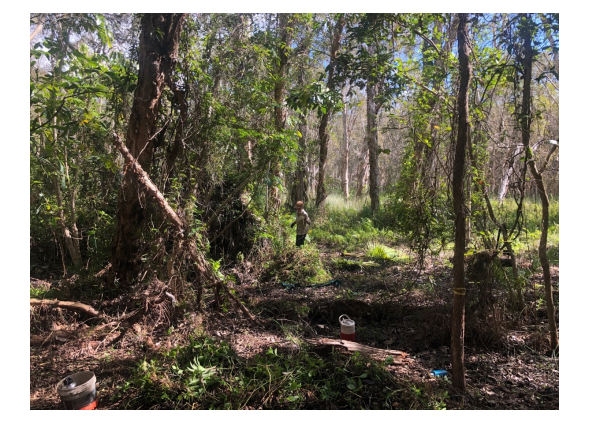
Coastcare News Update