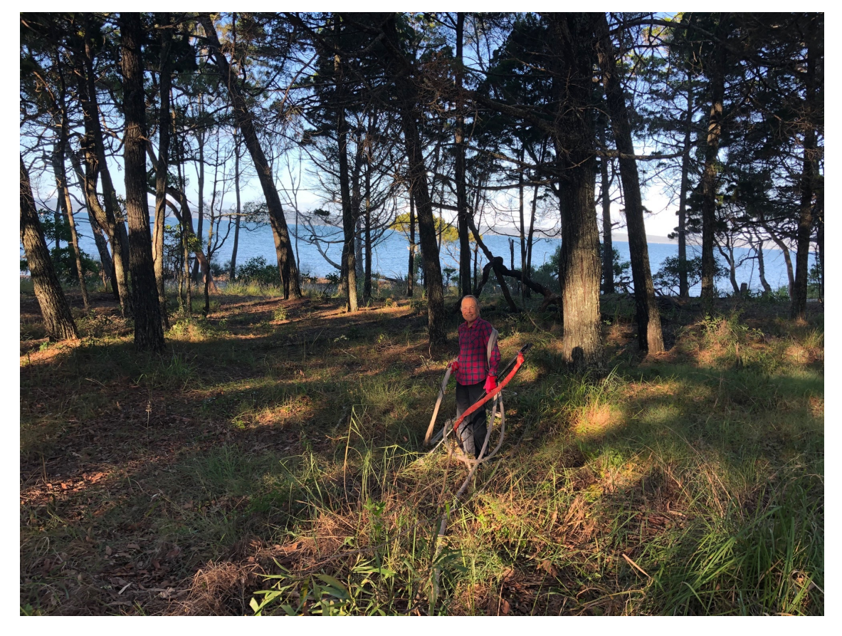
Heather Smith, trained operator, saturated steam weeding recently in the north-east zone