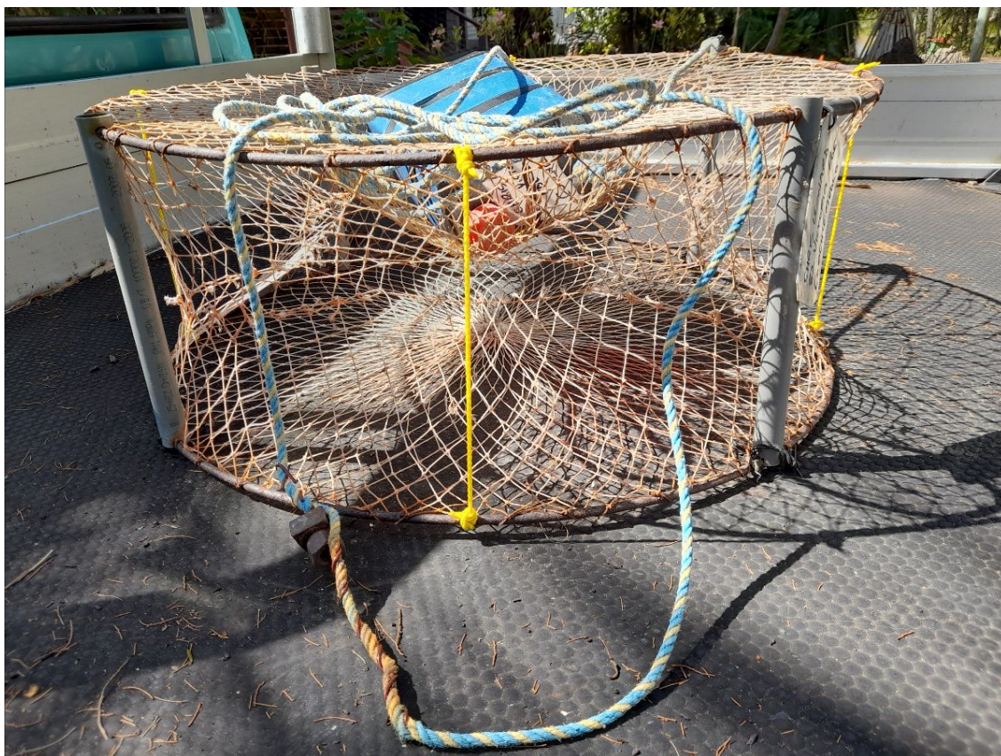
Above- Crab pot showing the turtle excluder in yellow