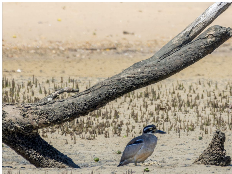
Beach stone curlew