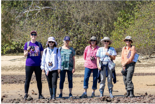
The gumboot & bino crew

The walk to celebrate World Shorebird Day organised by Conservation Volunteers Australia on Saturday 7 September attracted a good role-up of both visitors and locals. A perfect day with matching mid-morning low tide saw the group move from the western mangroves to Morwong. Along the way the following sightings including our shy beach stone curlews, (endangered in NSW and Vulnerable in Queensland) were recorded.