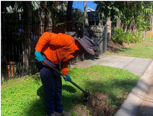
Inspecting nest after treatment

The following day two Biosecurity Inspectors spent time interviewing people, door-knocking, distributing brochures and investigating possible leads.