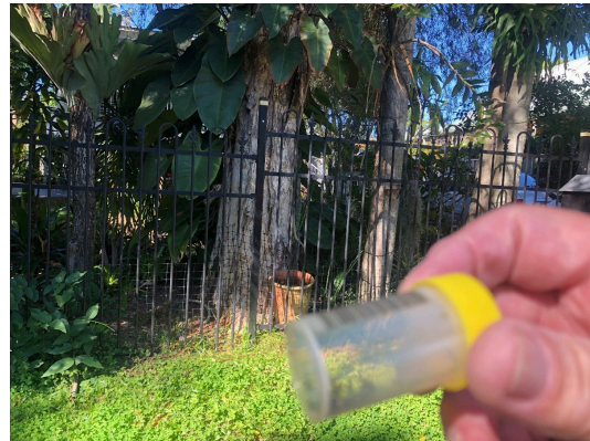
Ants for DNA testing

All residents and business owners on island and nearby locations are urged to check their properties now and report any suspected nests . You can do this online or by calling 13 25 23.